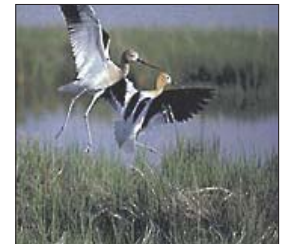
WRA is working to protect Great Salt Lake and the 10 million birds that depend on this habitat.