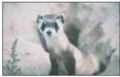
The black-footed ferret's habitat in Colorado is essential to its survival.