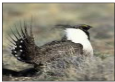
The endangered sage grouse's habitat is being threatened by irresponsible development.