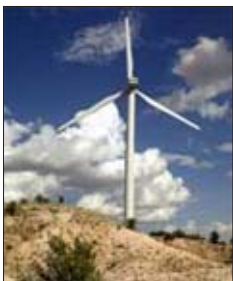
WRA will work to link clean energy that uses little water to power grids.