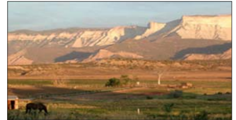
A ban on surface drilling lasting until June 2009 makes this a critical time for WRA to ensure protection for the Roan Plateau.