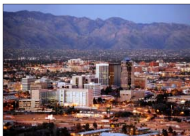
WRA's research shows how Arizona can meet growing electric needs without new coal plants.