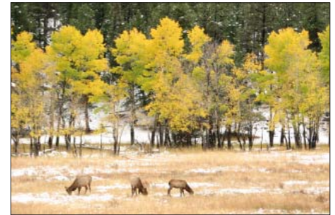
WRA defended 145,000 acres of valuable wildlife habitat from questionable oil and gas leasing.